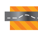
BROW OF A HILL